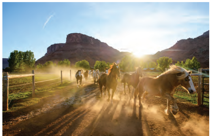
Sunset at the Ranch